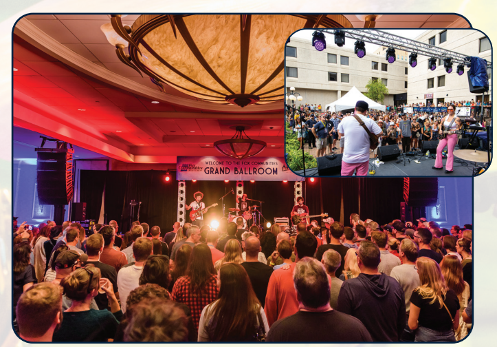
Hilton Appleton Paper Valley Hotel Ballroom & Courtyard